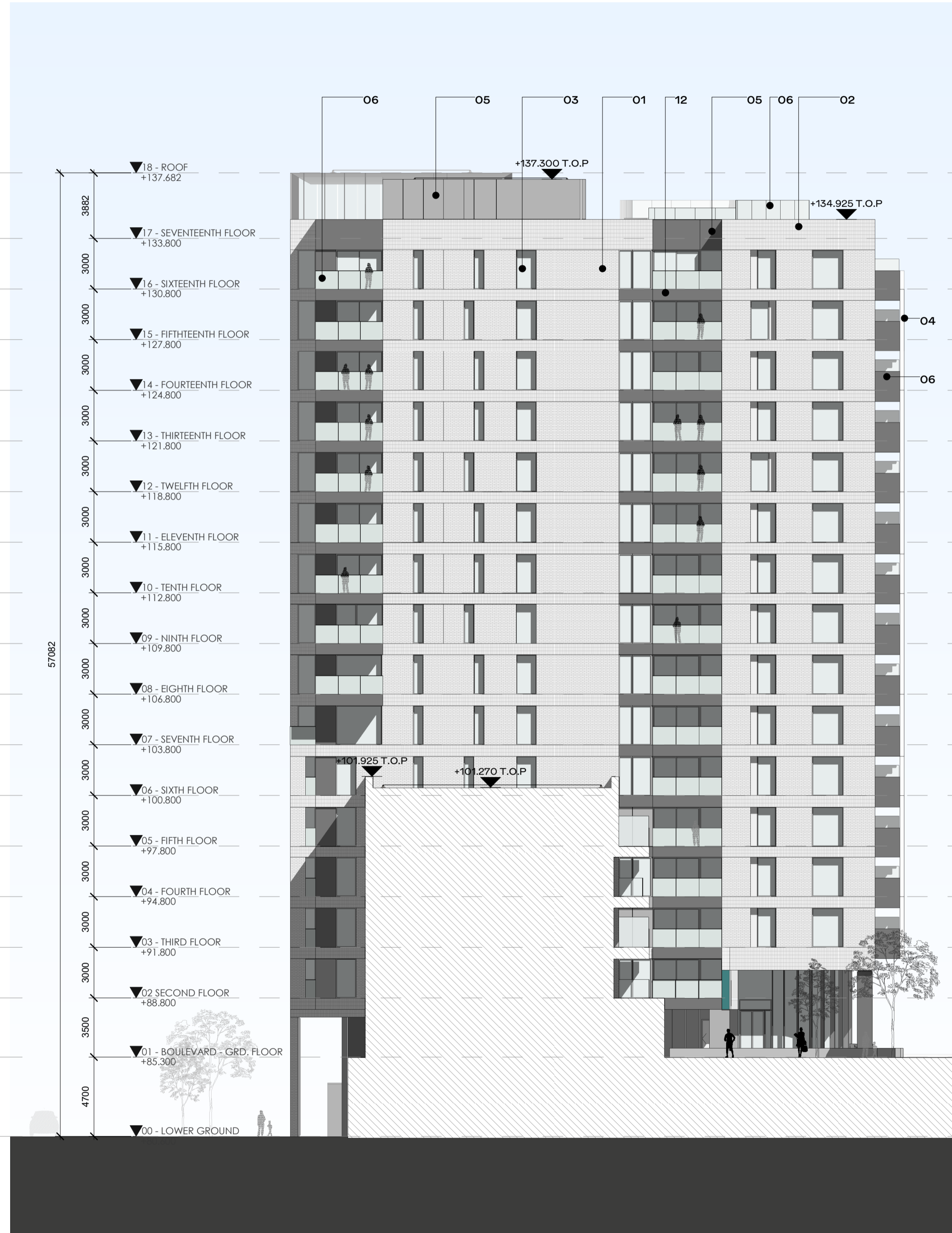
2 BLK C & D North West Elevation 1:200