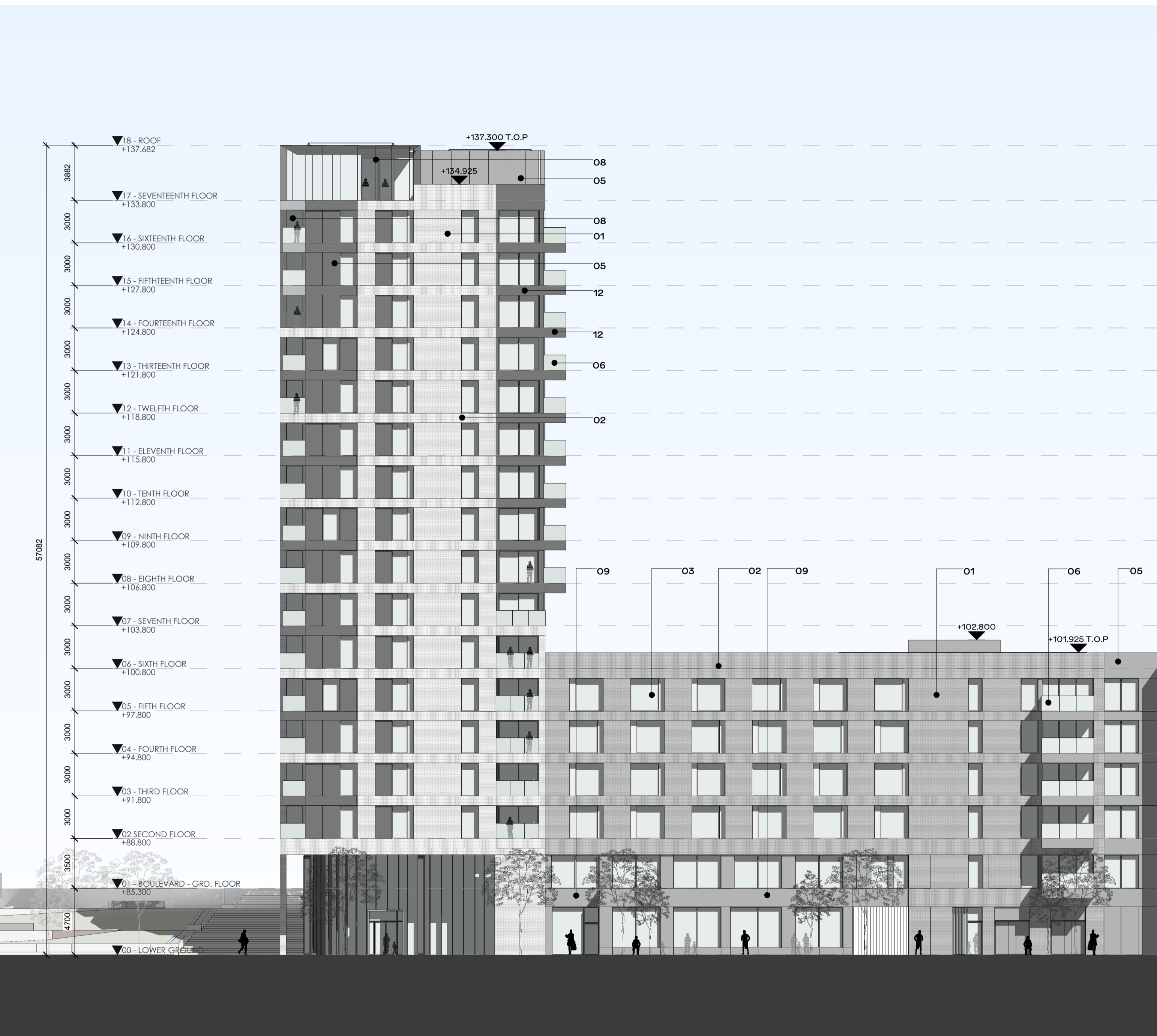
1 BLK C & D North East Elevation 1:200

Architecture + Interiors +353 1 888 3333 51-54 Pearse Street henryjlyons.com info@henryjlyons.com Dublin D02 KA66